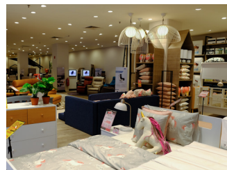
SHOPS AND STORE