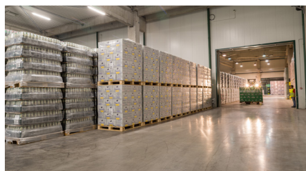
COLD STORAGE AND REFRIGERATED FACILITIES