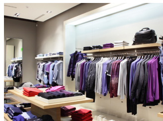
SMALL RETAILS CHAINS