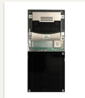
Main unit without camera