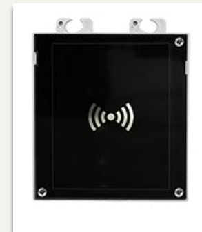
Secured RFID card reader 13,56MHz