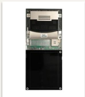
Main unit with camera