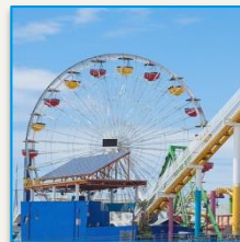
Leisure & entertainment